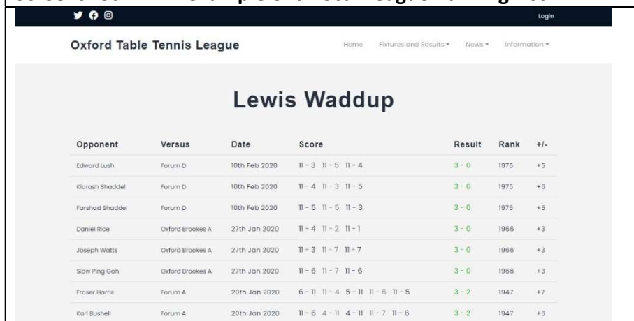
Screenshot 3 – Audit Trail for a Player